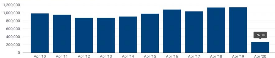
New passenger car registrations in the EU, month trend | 2010-2020

Next press release: Wednesday 17 June 2020